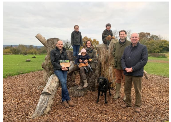
People's Choice Winner Easebourne Community Space

The winner of the Non-Residential Category went to Ditchling Museum, in Ditchling, East Sussex. Judges