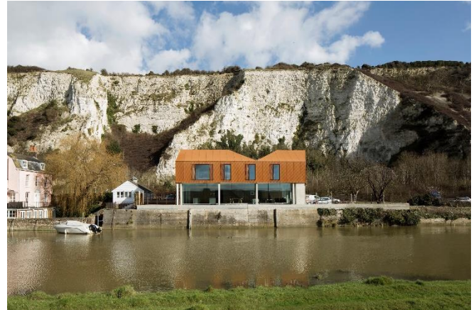
The Riverside House in Lewes, winner of Residential category

“With our Local Plan adopted earlier this year and setting the bar high for design excellence, it certainly bodes well for the future of the South Downs National Park.”